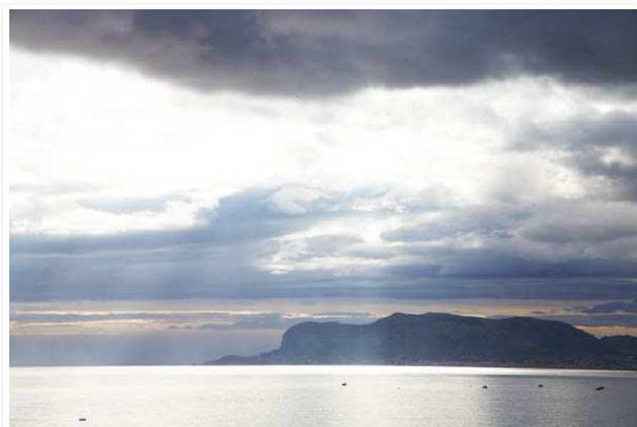
The sea, the mountains and the sun in Sicily, copyright BKWine Photography