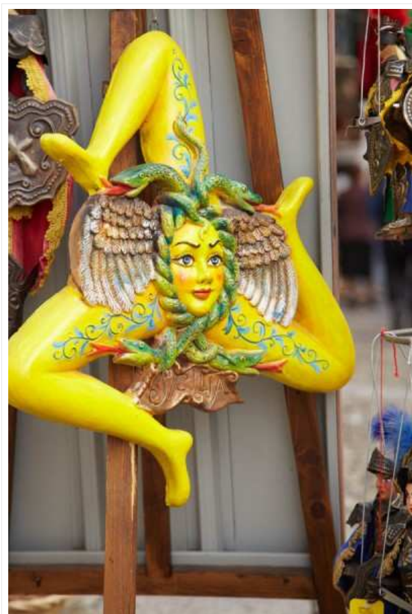
The Sicilian Triskelion three legged head symbol