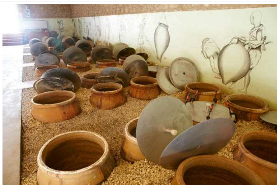
Clay amphorae in the wine cellar at COS