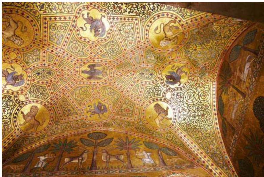
A church ceiling in Palermo with magnificent mosaics in gold and colour, copyright BKWine Photography