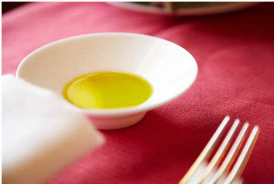
Sicilian olive oil at the Gulfi winery restaurant: an essential component of every meal