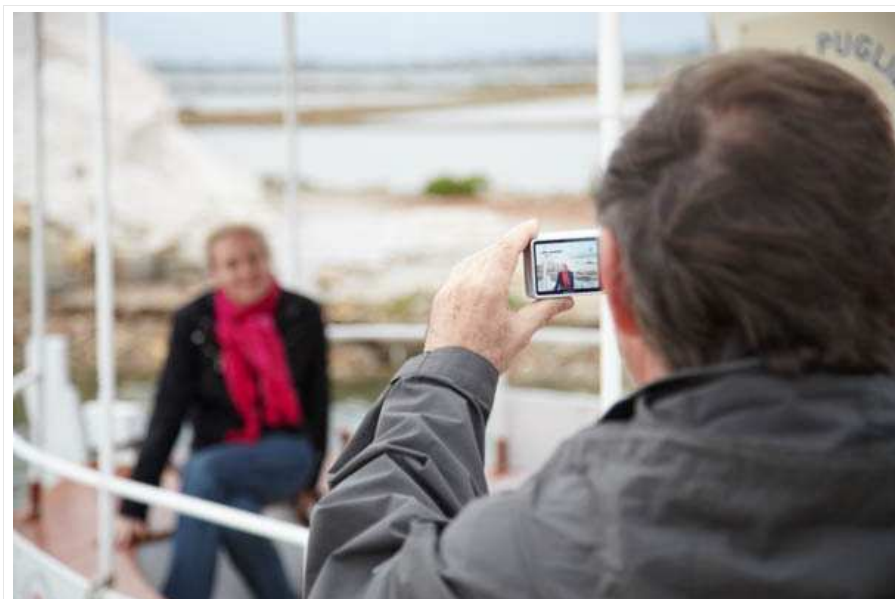
Visiting Sicily