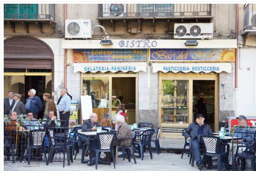
A cafe in Sicily in Italy