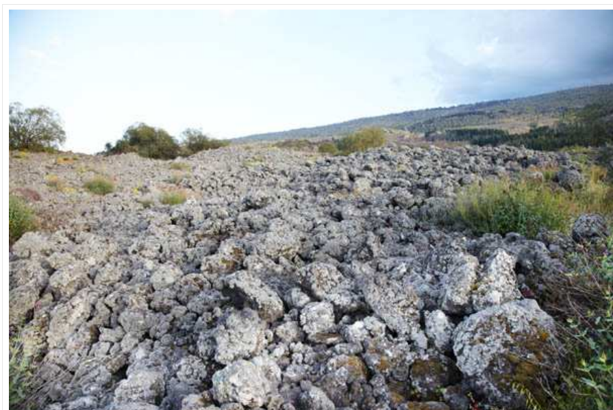
Black lava rock soil on Etna