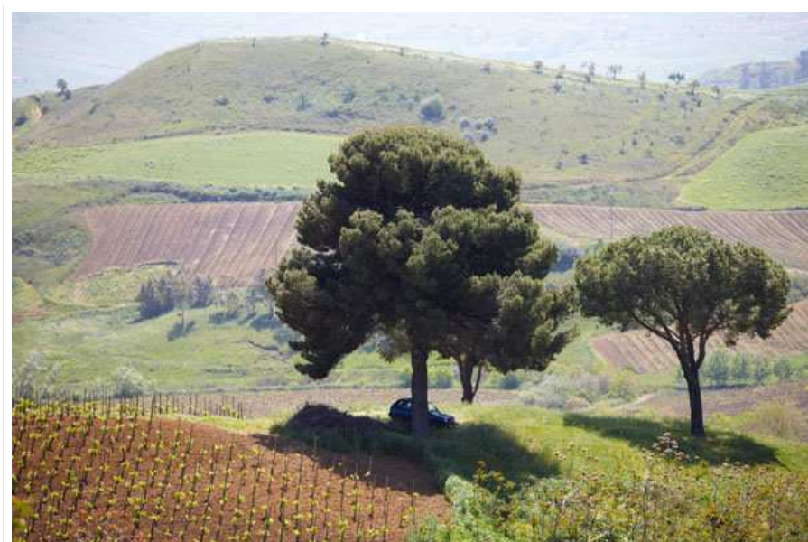
The vineyards and landscape at Tenuta Regaleali in Sicily