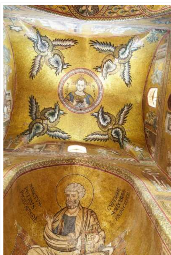
A church in Palermo with a magnificent mosaic ceiling, copyright BKWine Photography