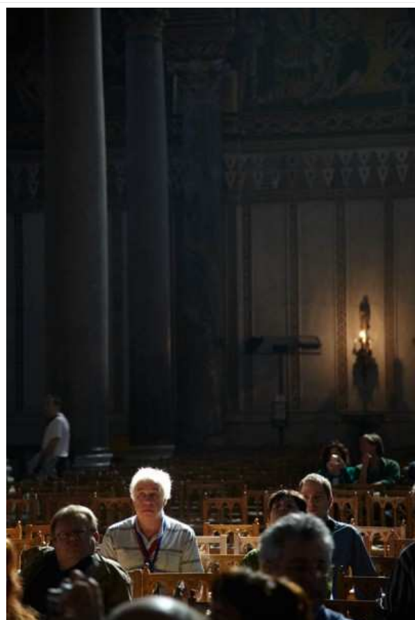
A man in a church in Palermo