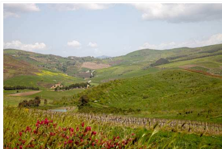
Rolling hills, vineyards and flowers in the centre of Sicily