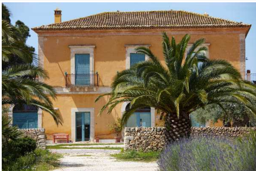
One of the buildings at the COS winery