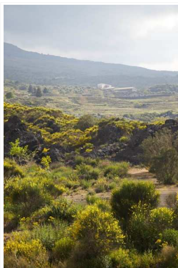
The wild landscape on Sicilian mountains