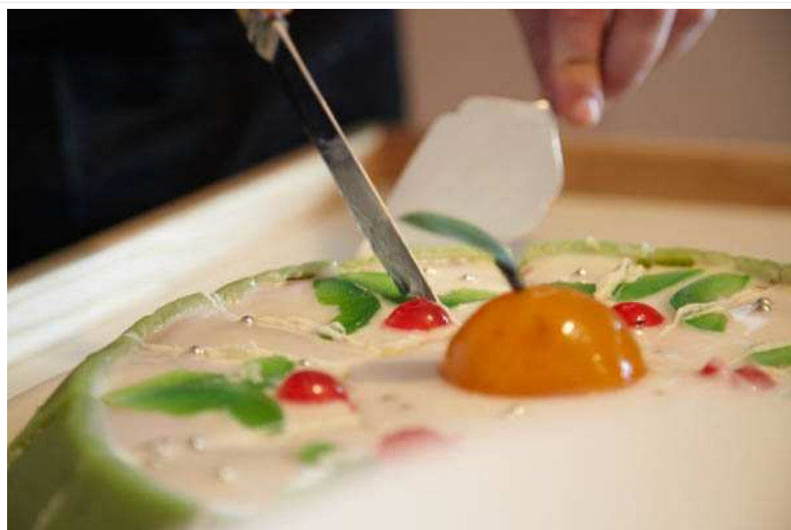
A traditional Sicilian cassata almond cake ends lunch at Planeta