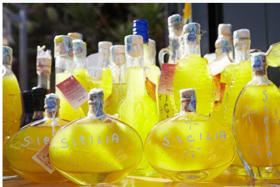
Sicilian lemon limoncello liqueur