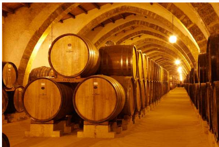
The Florio winery wine cellar filled with sweet marsala wine, copyright BKWine Photography