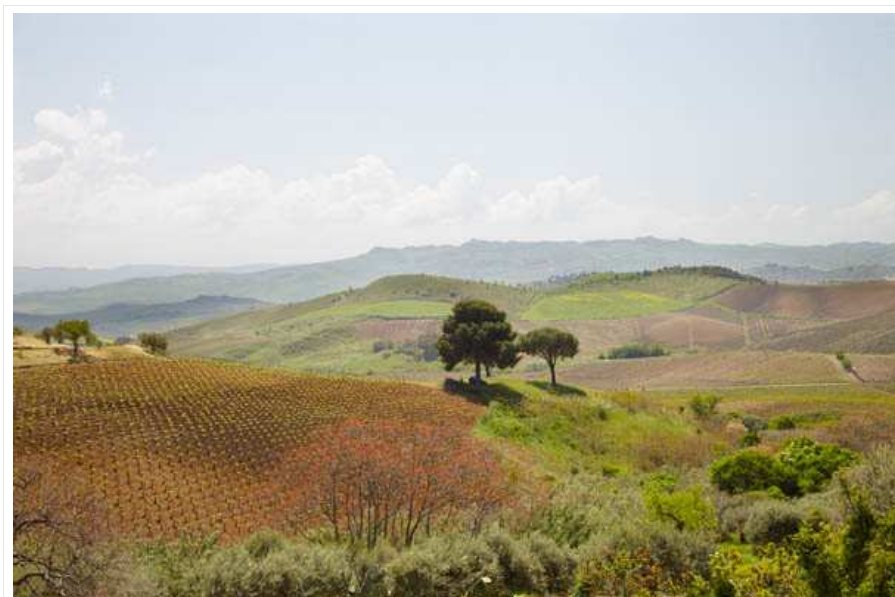
Vineyards in the centre of Sicily near Regaleali, copyright BKWine Photography