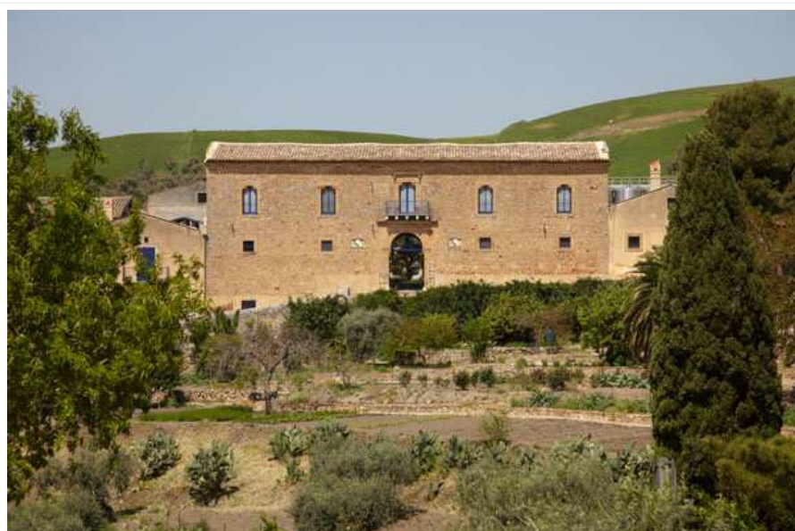
Tenuta Regaleali in Sicily, copyright BKWine Photography