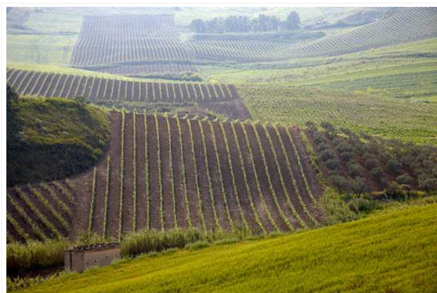
Vineyards at Planeta, Sicily