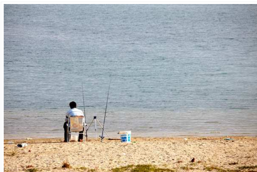
A man on the beach fishing