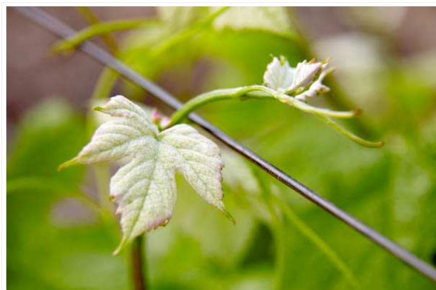
A young vine in spring