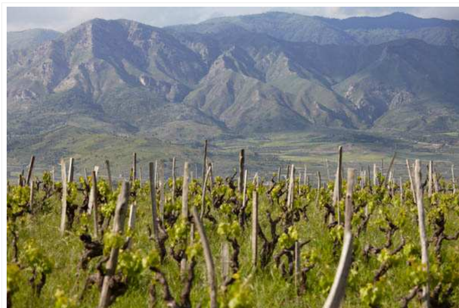
Vineyards at Passopisciaro on the slopes of the Etna volcano