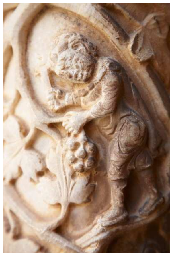
Sculpture on a pillar in a monastery of a wine harvest