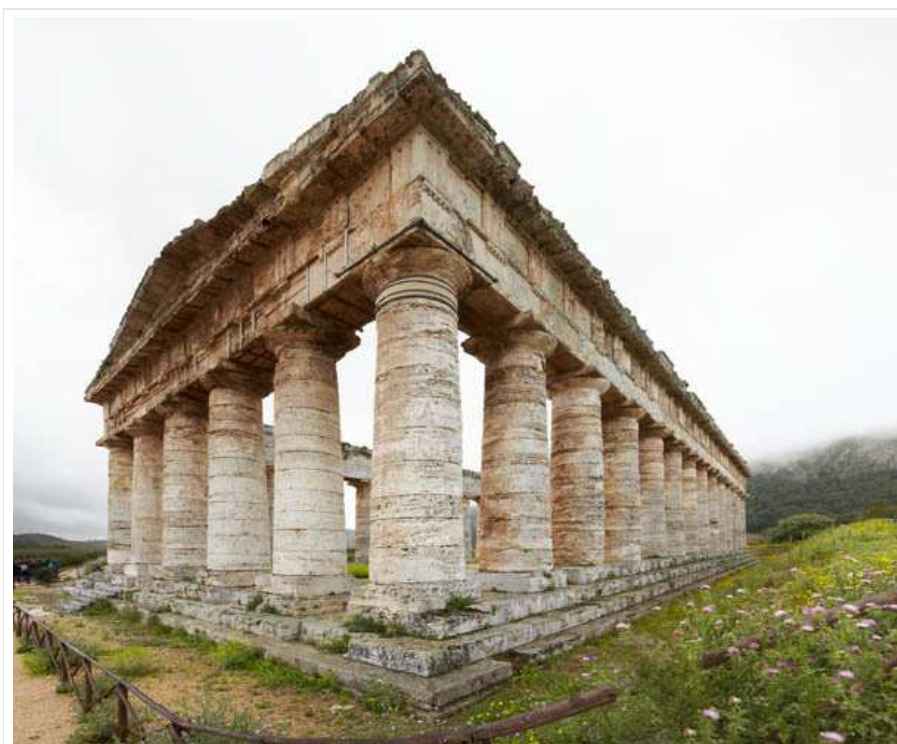
An old Greek temple near Palermo on Sicily