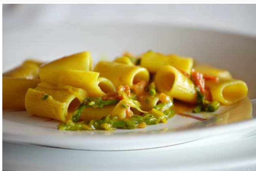
Home cooked pasta with vegetables at Planeta