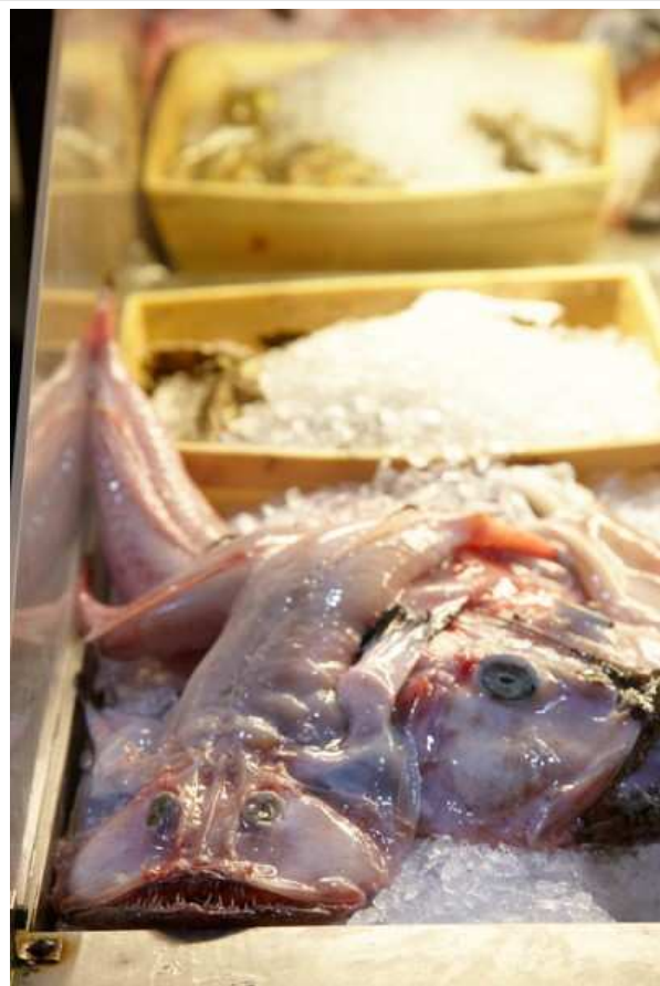
A monk-fish at a restaurant waiting to be prepared