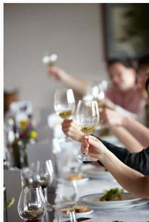
A cheer for the wines and food from Sicily at Planeta