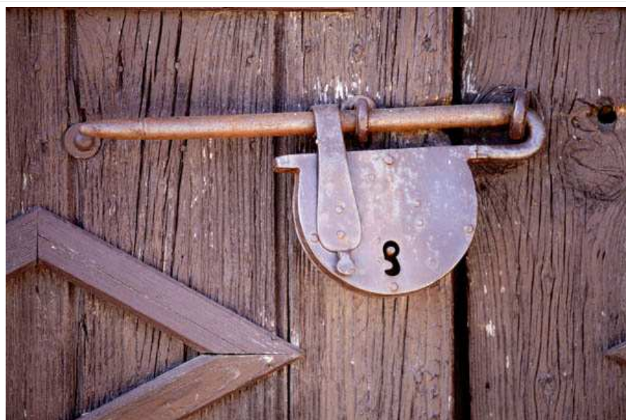
An old padlock on the winery door