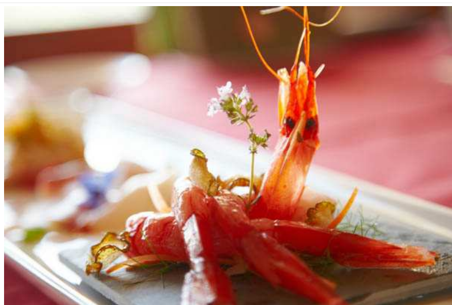
An elegant seafood creation as a starter for lunch at Gulfi, copyright BKWine Photography