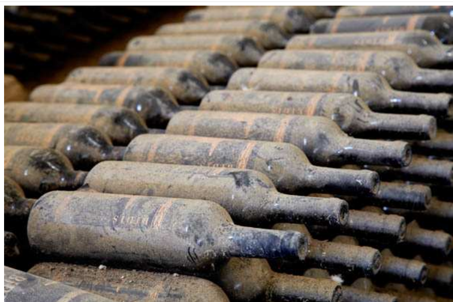
Wine bottles resting in the cellar at Valle dell'Acate winery wine cellar