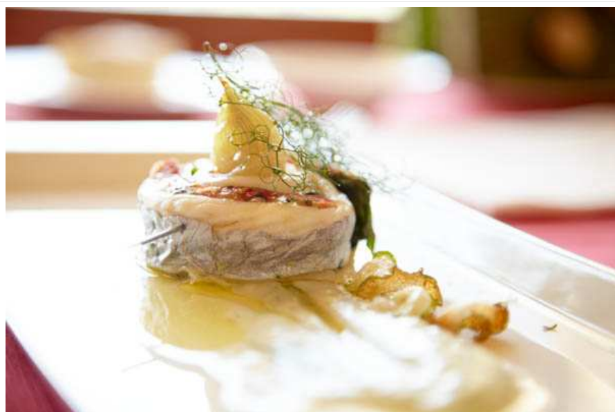
A local fish elegantly served for lunch with a dash of olive oil on top