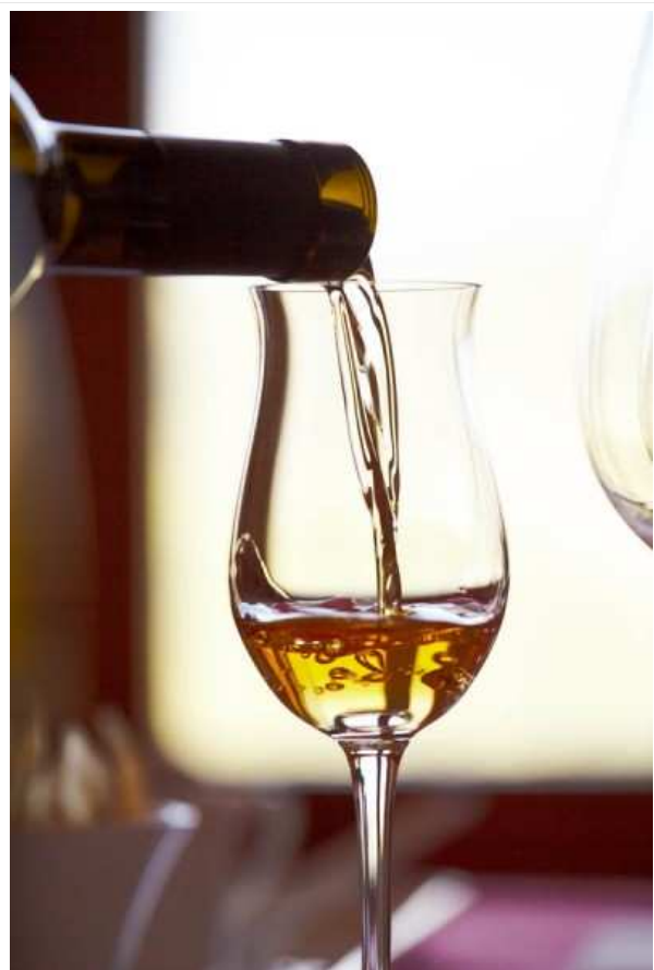
A glass of luscious sweet Sicilian wine