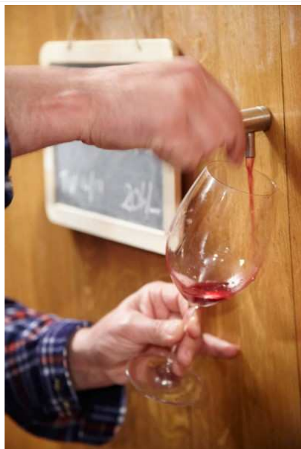
Pouring a sample of wine in the cellar at Passopisciaro