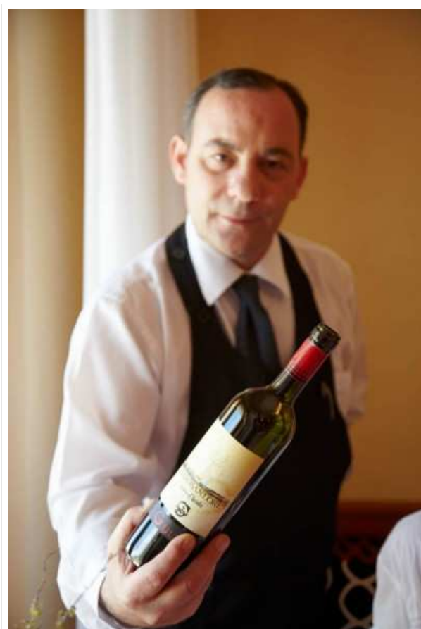
Would you like a glass of Sicilian wine?