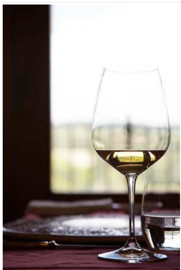
A glass of white wine to start lunch at Gulfi