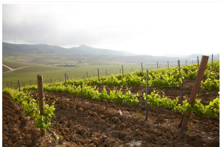
Vineyards at the Rapitala winery