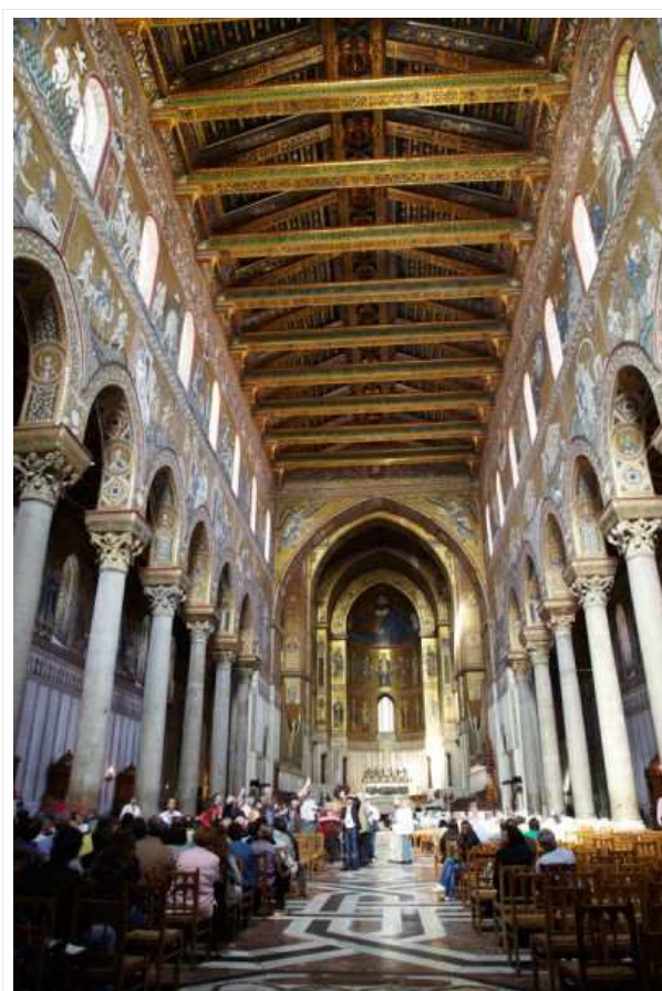
A church in Palermo with a magnificent mosaic ceiling