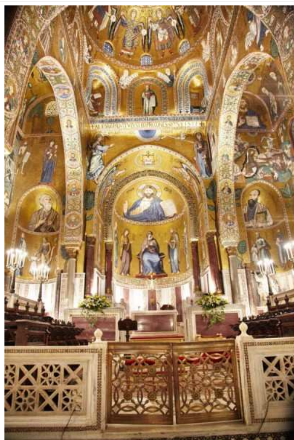
A church in Palermo with magnificent mosaics in gold and colour