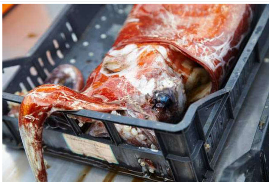
The morning's fishing catch: a big squid