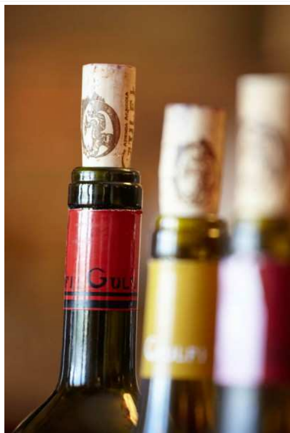
A selection of wines for lunch at the Gulfi winery