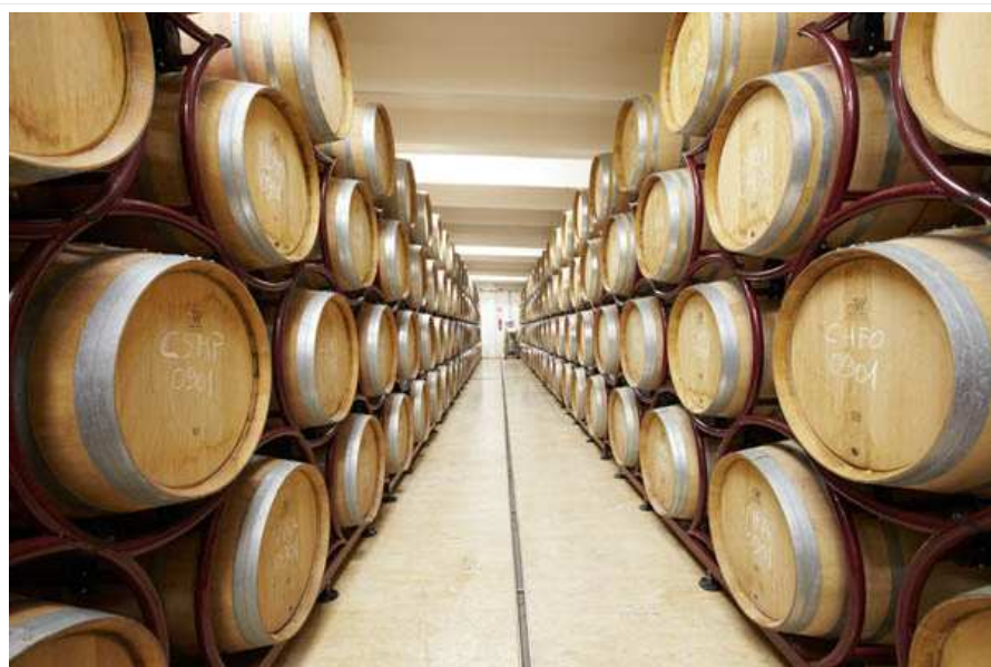
Oak barrels resting in the cellar at the Rapitala winery